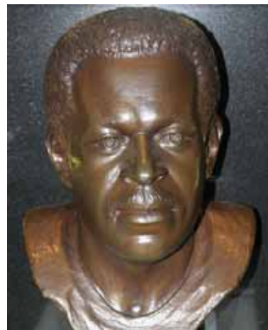
The bronze busts of Javelina Pro Hall of Fame members Darrell Green, top, and Gene Upshaw are in the Hall of Fame museum.