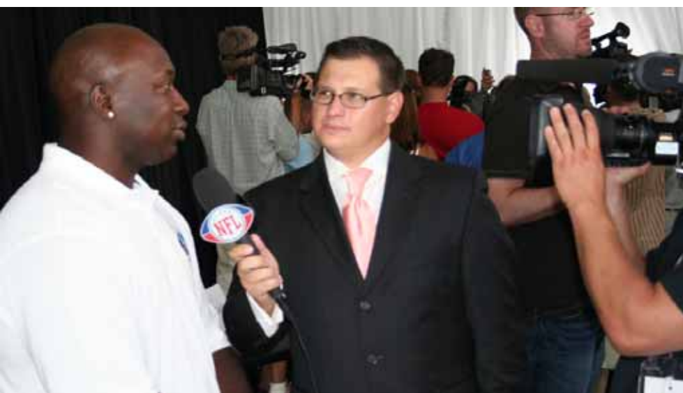
John Randle being interviewed by NFL Network during one of the press conferences last week.