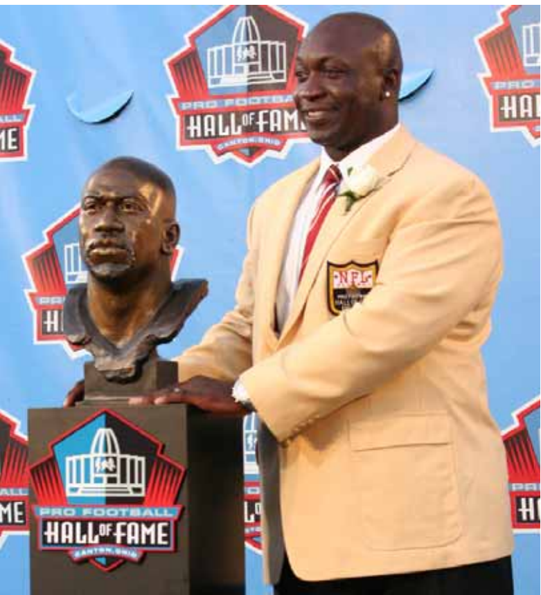
John Randle with his bronze bust following his induction into the Pro Football Hall of Fame.