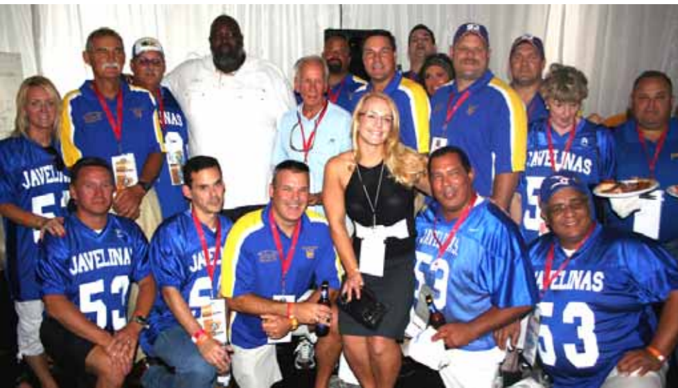
Some of the Javelinas pose at the tailgate party prior to the Pro Football Hall of Fame enshrinement Saturday in Canton, Ohio.