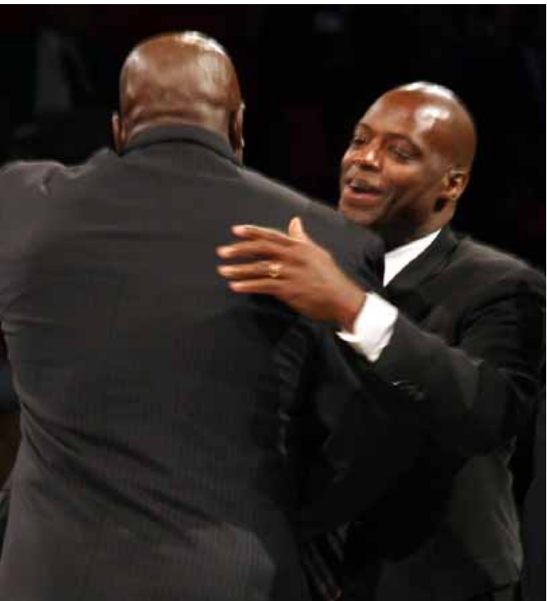
Javelinas John Randle and Darrell Green greet at a Friday night dinner that saw the Hall of Fame members meeting with the 2010 inductees.