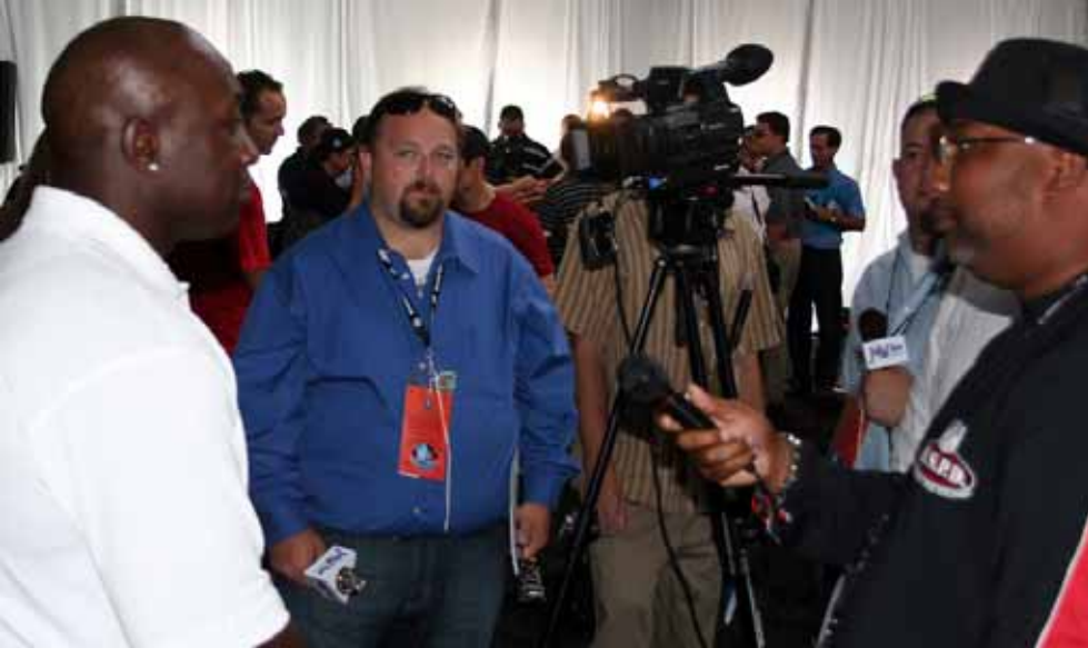
One of Many

John Randle during one of his many interviews during last week's Pro Football Hall of Fame activities in Canton, Ohio. Randle became the third Javelina to be inducted into the Hall.