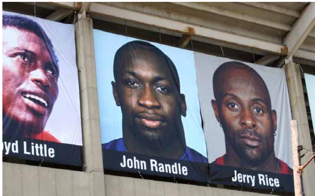
A banner with John Randle's picture hung, with the other 2010 inductees, from the stadium where the Hall of Fame is played in Canton.