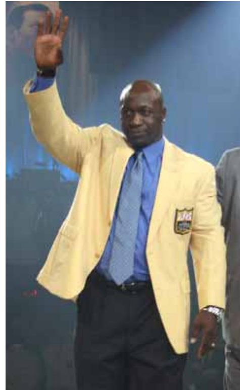
John Randle greets the audience after receiving his gold jacket Friday night during a banquet attended by more than 4,000 fans.