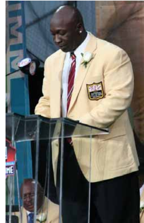
John Randle delivers his induction speech at the Pro Football Hall of Fame enshrinement ceremonies Saturday night in Canton.